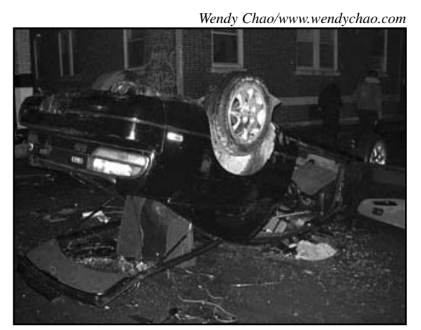
No-parking zones at event locations can reduce the likelihood that cars will be flipped, burned or vandalized such as occurred in Boston after the 2004 World Series.

12. Limiting parking. Limiting parking at or near a gathering can help to reduce the amount of damage should a disturbance occur. 56 Forcing people to park some distance away increases the effort needed to get to the event. This may discourage some people from attending. No-parking zones at the event location reduce the likelihood that cars will be flipped, burned, or vandalized by members of the gathering. In addition, efforts to disperse the gathering in case of emergency will not be hampered by traffic jams or accidents caused by a panic.