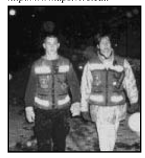
Student patrols can help maintain order at large gatherings and reduce the need for intervention by authorities.

University of Illinois at Urbana - Champaign http://www.dps.vivc.edu