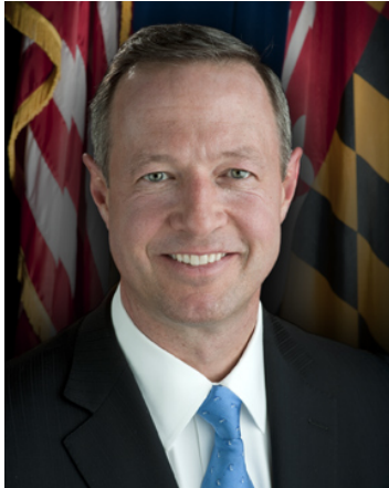
MARTIN O'MALLEY GOVERNOR

STATE HOUSE 100 STATE CIRCLE ANNAPOLIS, MARYLAND 21401-1925 (410) 974-3901 (TOLL FREE) 1-800-811-8336 TTY USERS CALL VIA MD RELAY GOVERNOR.O'MALLEY@MARYLAND.GOV