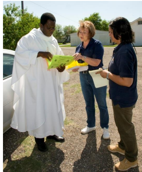
La Paloma, TX, August 2, 2008 – A FEMA Disaster Survivor Assistance Team chats with a local Catholic priest about FEMA and services that may be available to members of his parish. FEMA worked with state, local, and volunteer organizations to provide services to residents affected by Hurricane Dolly.

The faith-based and community sectors have a wide spectrum of resources that can help make communities more resilient. By creating a broad set of partnerships, emergency managers can gain access to this wide array of force multipliers and existing networks of community members who can aid in building community resilience.