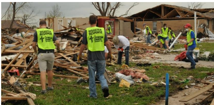
Moore, OK, May 26, 2013 – Volunteers with the Missouri Lutheran Church Disaster Response team help survivors clean up after a deadly tornado. Volunteers provided much needed personal services and were important FEMA partners in disaster recovery.

In contrast, respondents noted that sharing engagement responsibilities among multiple organizations, including emergency management agencies, results in expansive, cross-sector partnerships. The DHS Center tested this approach through the creation of a seven-step engagement process.