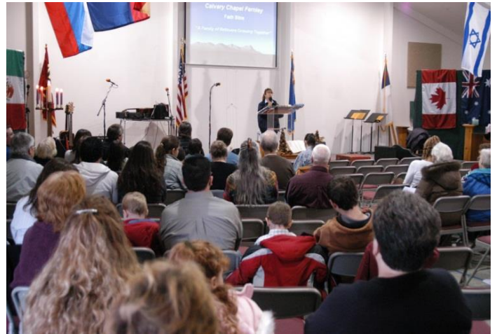
Fernley, NV, January 13, 2008 – A FEMA Disaster Survivor Assistance Team (DSAT) member tells the Calvary Chapel congregation about available FEMA services for residents affected by flooding. DSAT workers contact groups to explain FEMA programs and assistance.

By incorporating these sustainability tips focused on long-term and continuous partner engagement, emergency managers can effectively build resilience across diverse communities.