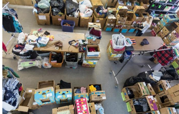
Houston, TX, September 6, 2017 – Faith Center of Houston’s First Baptist Church, a charitable donation center for Houston’s poor and disadvantaged, provides food, water, clothing, cleaning and household supplies to Hurricane Harvey survivors. FEMA partners with federal agencies, states, local communities, counties, Voluntary Organizations Active in Disaster (VOAD), and tribal entities in providing assistance to disaster survivors.

Through the seven-step process, emergency managers can identify and engage with faith-based and community groups in underserved communities and assess their capacity to participate in emergency preparedness activities. Based on that assessment, emergency managers can build partnerships with these groups, provide training and technical assistance to strengthen their skills, connect them with existing partners, and then integrate them into emergency management plans and exercises. The DHS Center used this process in a 2011 pilot in Miami-Dade County, Florida, and in several jurisdictions since then: City of Los Angeles/Los Angeles County, California; Lakewood Township/Ocean County, New Jersey; Albuquerque, New Mexico and New Orleans, Louisiana. The outcomes of these pilots demonstrate that communities can effectively integrate faith-based and community groups into emergency management plans and operations by using the customizable seven-step engagement process.