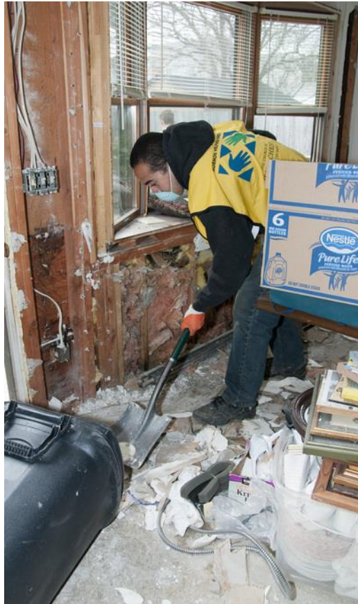
Seaside Heights, NJ, November 24, 2012 – A member of the Mormon Disaster Relief effort clears drywall from a home in Seaside Heights, N.J. that was damaged when Hurricane Sandy came ashore. Volunteer organizations like the Mormon Church and other faith-based programs provided free assistance to survivors in the affected area.

Other government offices may have existing networks with faith-based and community organizations throughout the community. Emergency managers should collaborate with these government offices to reach the broad set of organizations discussed above.