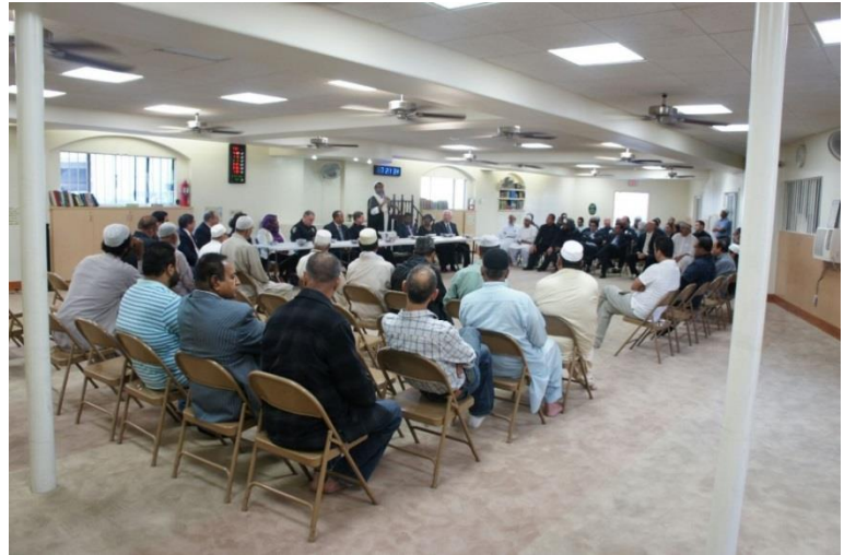
Inglewood, CA, July, 2014 – The DHS Center partners with the Council on Pakistani American Affairs, City of Los Angeles and Los Angeles County Office, and University of Southern California Center for Religion and Civic Culture (CRCC) to engage imams and leaders within the Islamic faith in disaster preparedness during Ramadan.

Schedule periodic meetings with faith-based and community partners. In many communities, it may prove difficult for all of the partners to commit to monthly meetings given their wide array of responsibilities. However, the benefit of periodic (even bi-monthly or quarterly) check-in meetings can be significant.