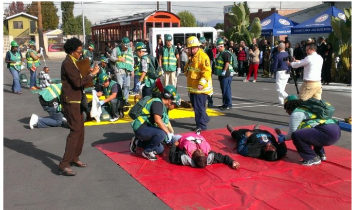
Los Angeles, CA, April 2014 – Los Angeles Fire Department and LA County Public Health conduct CERT training with South Los Angeles youth and young adults.

With the help of the FEMA Individual and Community Preparedness Division and FEMA’s Office of External Affairs, standardized exercises are available for use with faith-based and community groups. In addition, the Homeland Security Exercise and Evaluation Program (HSEEP) provides guidance for jurisdictions to develop their own exercises. See the links in Appendix C for sample exercises.