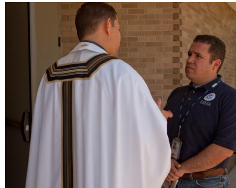
Pensacola, FL, May 18, 2014 – A Spanish speaking Disaster Survivor Assistance Team (DSAT) member listens to a priest's concerns at an event at St. John Church. FEMA's DSAT disseminated incident information in Spanish after Sunday service. Torrential rain from a pair of thunderstorms triggered major flash flooding in the area.

The DHS Center developed the seven-step engagement process in conjunction with the DHS Science and Technology Directorate to study and promote best practices on engaging faith-based and community organizations in emergency preparedness. The process can help jurisdictions improve emergency operations capabilities by helping them effectively engage faith-based and community groups. These groups, in turn, become significant force multipliers, connecting with historically underserved populations.