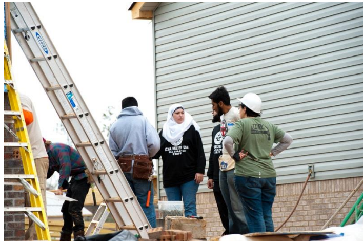
Pratt City, AL, January 17, 2012 – Habitat for Humanity and Jewish and Muslim New York University student volunteers rebuilding homes after deadly tornadoes struck the Southeast.

Integrate affiliated groups into existing emergency operations plans. Writing affiliated groups into existing emergency operations plans can support the full integration of these engagement benefits into day-to-day emergency management practices. Furthermore, by outlining the roles and responsibilities of these non-traditional partners within emergency operations plans, subsequent emergency managers can both recognize and continue to build upon the work already begun.