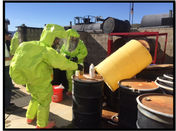
Level “A” Suits