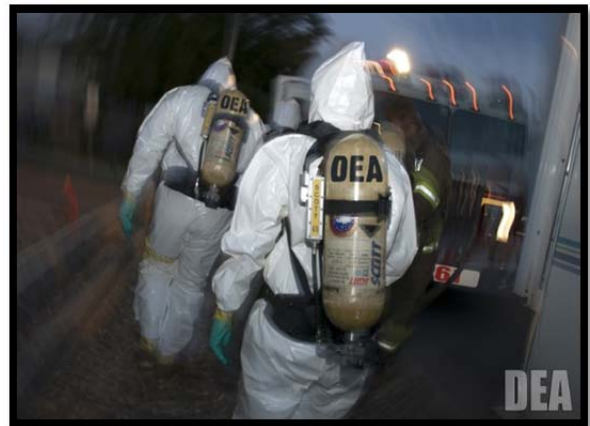
Level “B” Suits