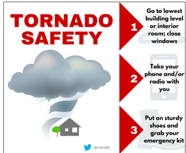
Figure 6: Sample tornado safety graphic.