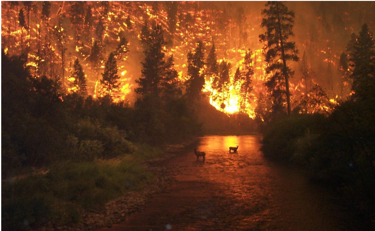
Figure 3: "Elk Bath" photo taken in 2000, which has been erroneously shared and attributed to other wildfires.

As recently as 2016, this fire was used to represent a fire burning in Tennessee. The rumor was corrected by KRTV , correctly assigning the location and date the photo was captured.