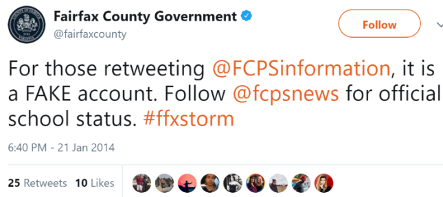
Figure 1: Official Tweet from Fairfax County Government addressing fake Twitter account.

Incorrect information can be caused by situations where the true situation is difficult to confirm. Radiation in Japan was a good example. After the meltdown at the Fukushima Daiichi Nuclear Power Station in March 2011, many rumors circulated regarding appropriate safety precautions, such as whether people should evacuate, the possibility of food and water shortages, and whether there would be additional radioactive releases (this example also illustrates insufficient information).