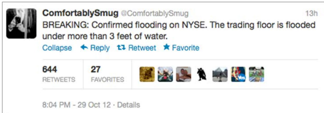
Figure 2: Tweet from user @ComfortablySmug sharing a rumor.

Another example comes from Hurricane Sandy in October 2012. Twitter user @ComfortablySmug began spreading several rumors via social media, including that the New York Stock Exchange Building was flooded, Con Edison was preemptively shutting off power in New York City, and all bridges going to and from Manhattan were being sealed off (Figure 2, below). Additionally, digitally altered pictures of sharks swimming in the streets, screenshots from the movie The Day After Tomorrow and other dramatic pictures from past storms proliferated on social media. 20 Incorrect information can also be malicious (see the Motivation section above), as with online conspiracy theorists harassing survivors of the Las Vegas mass shooting in October 2017. 21