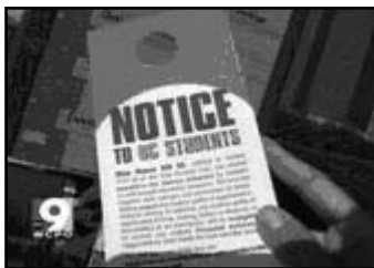
New students receive door hangers in residence halls to remind them of alcohol laws and policies at the University of Northern Colorado.