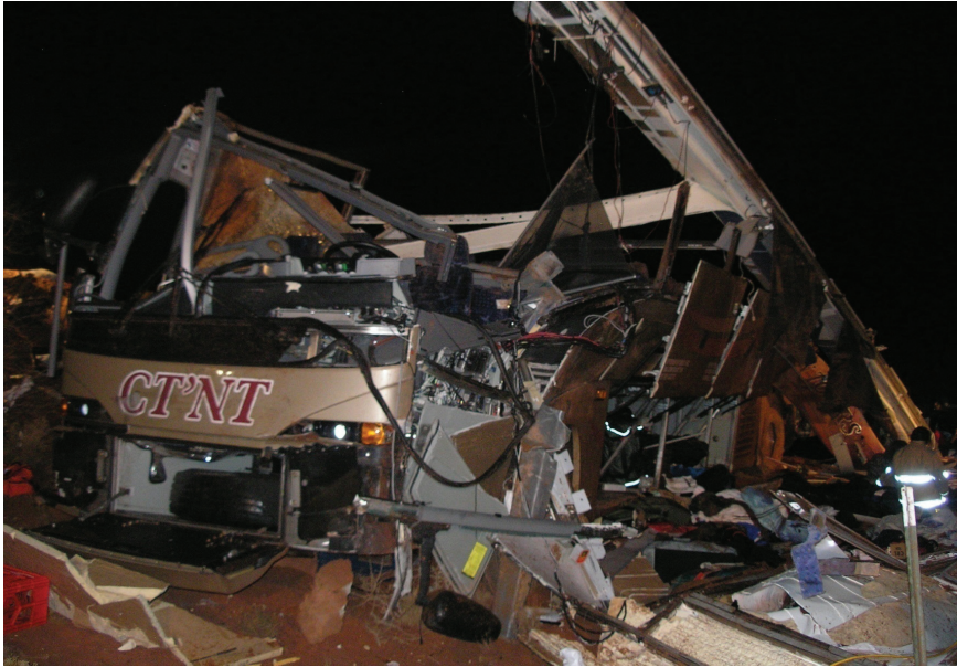
FIGURE 2-1 The fourth tour bus after a 360-degree roll 41 feet down an embankment.