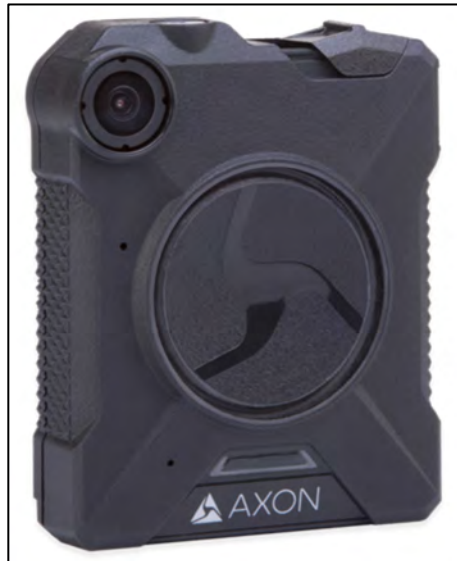
Figure 50. TASER Axon Body 2