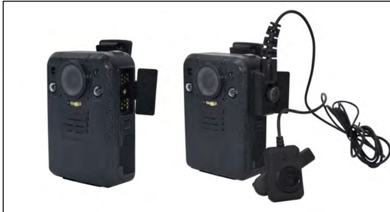
Figure 42. Primal USA DutyVUE PrimeOBSERVER I