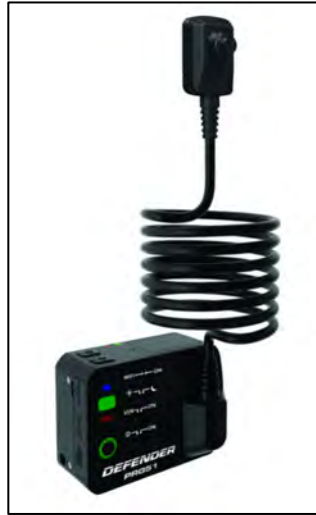
Figure 38. PRG 51 Defender Body Worn Camera