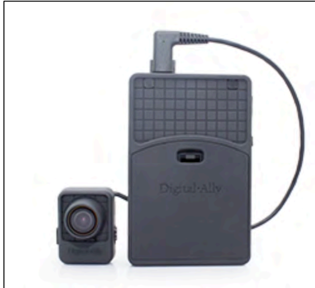
Figure 11. Digital Ally FirstVu HD Body Worn Camera