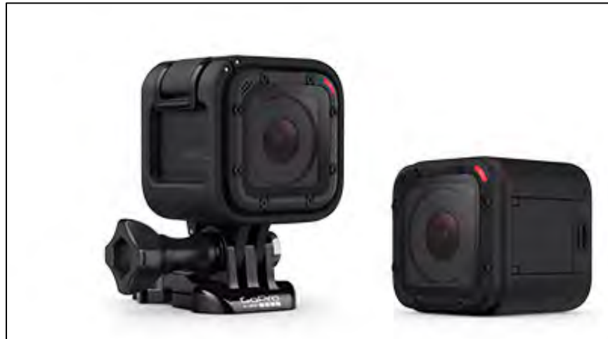
Figure 17. GoPro Hero4 Session