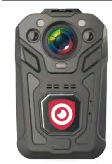
Figure 43. Primal USA DutyVUE PrimeOBSERVER II