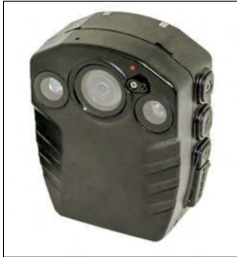
Figure 3. BrickHouse Security HD Waterproof Police Camera