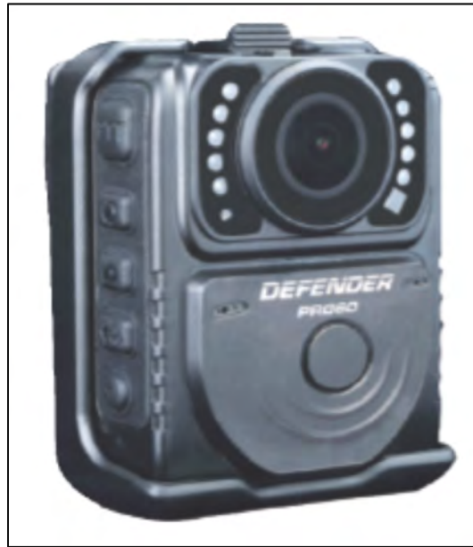
Figure 39. PRG 60B Defender Body Worn Camera