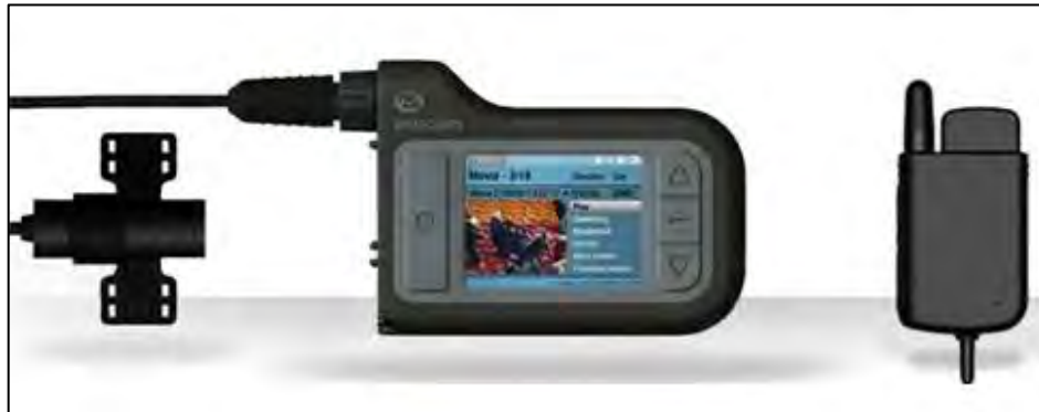
Figure 63. Zepcam TI