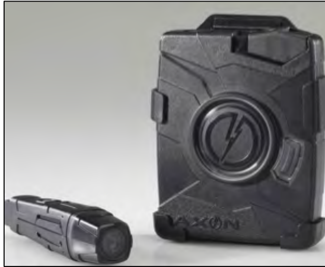
Figure 51. TASER Axon Flex