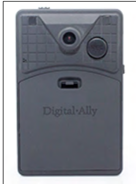
Figure 12. Digital Ally FirstVu HD One Body Worn Camera