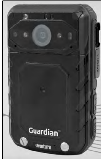
Figure 1. Aventura GPC-RA Body Worn Camera