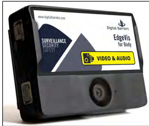
Figure 6. Brimtek EdgeVis VB320W