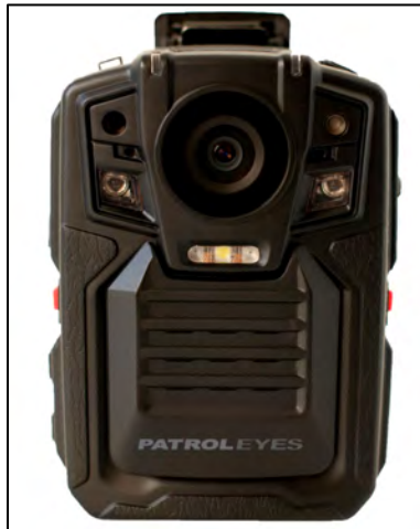
Figure 31. Patrol Eyes SC-DV5