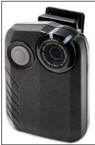
Figure 9. Data911 Verus BX1 Body Camera