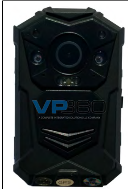
Figure 56. VP360 Argus Gen 1 Digital BWC