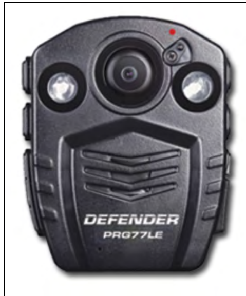
Figure 40. PRG 77LE Defender Body Worn Camera