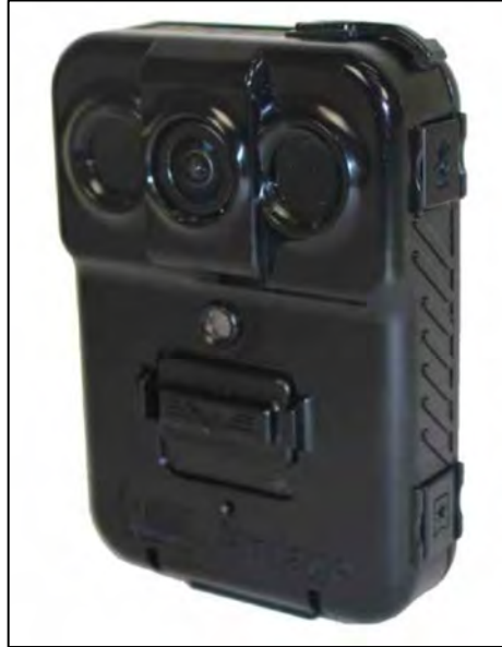
Figure 21. Kustom Signals Eyewitness Vantage