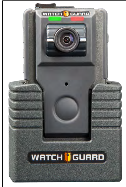
Figure 60. WatchGuard Vista WiFi