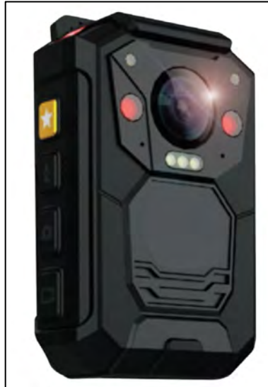
Figure 18. HauteSpot HauteVIEW 100