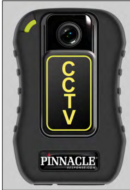
Figure 35. Pinnacle PR5 BWV Camera