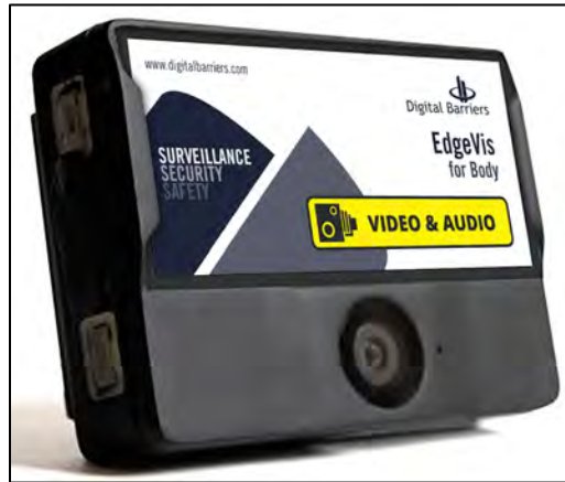
Figure 7. Brimtek EdgeVis VB340W