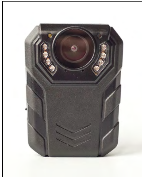
Figure 33. Patrol Eyes SC-DV7