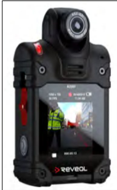
Figure 46. Reveal Media RS2-X2L