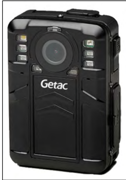
Figure 10. DEI Getac Veretos Body Worn Camera