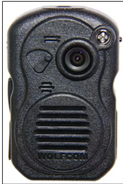
Figure 61. WOLFCOM 3 rd Eye