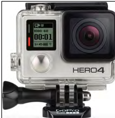
Figure 16. GoPro Hero4 Silver