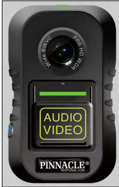
Figure 36. Pinnacle PR6 BWV Camera