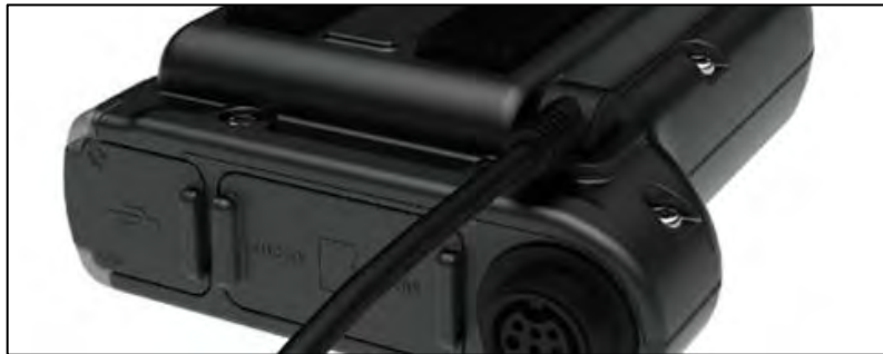
Figure 64. Zepcam TI XT