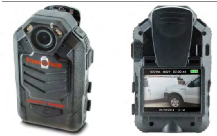
Figure 49. Safety Vision Prima Facie