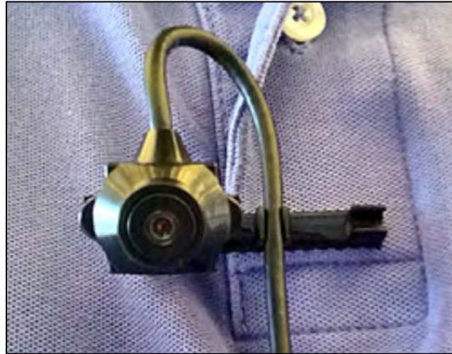
Figure 13. FlyWire Body Worn Security Cam Kit