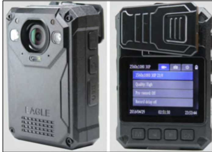
Figure 15. Global Justice Eagle NextGen