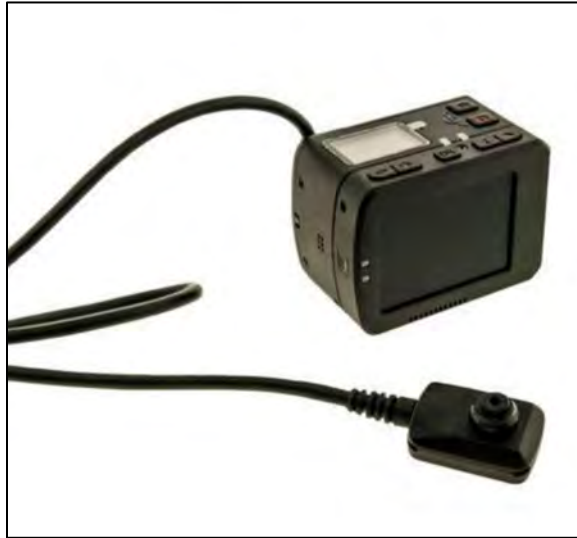
Figure 5. BrickHouse Security HD WiFi Police Button Camera