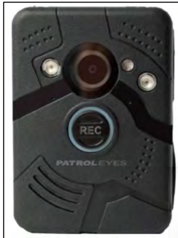
Figure 32. Patrol Eyes SC-DV6