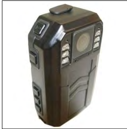
Figure 52. Titan BWC-3HV2