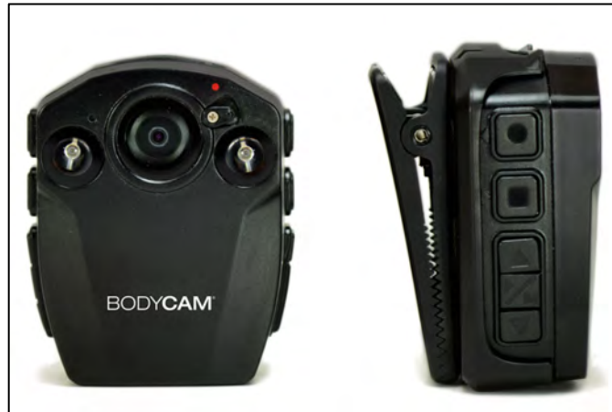
Figure 45. PRO-VISION BodyCam