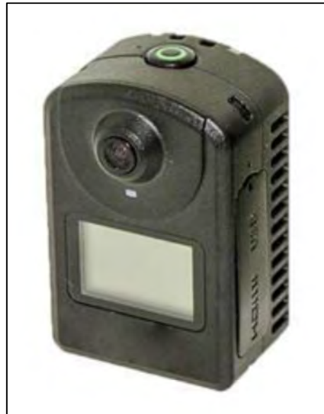
Figure 4. BrickHouse Security Ultra Compact HD WiFi Camera