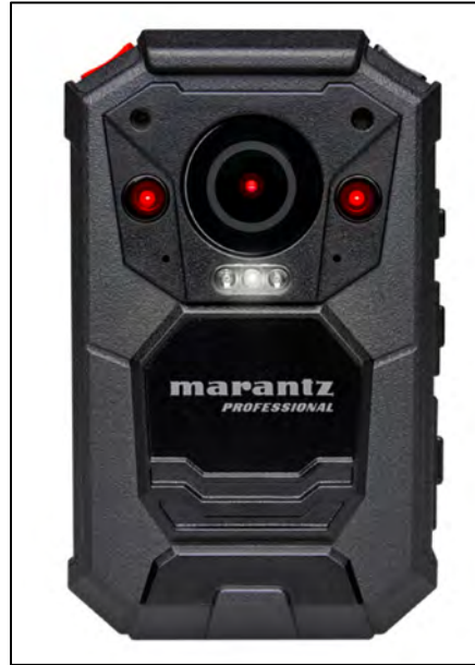
Figure 24. Marantz Professional PMD-901V