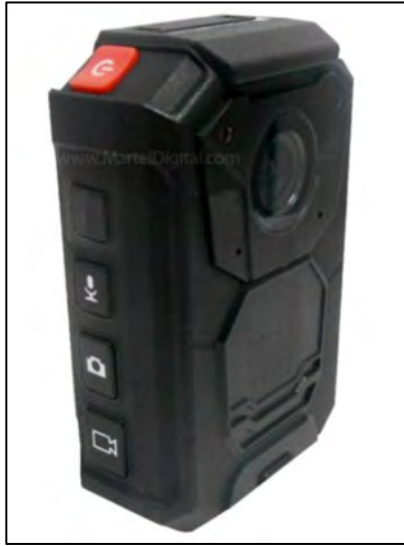
Figure 25. Martel Frontline Cam