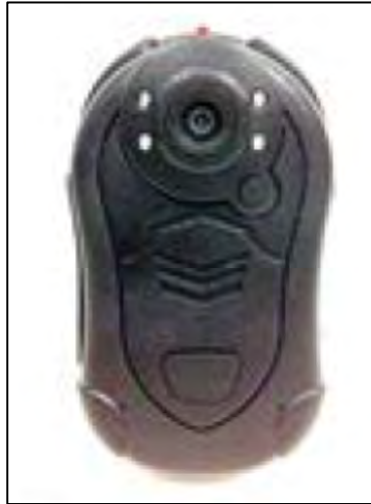
Figure 26. Martel Vid-Shield