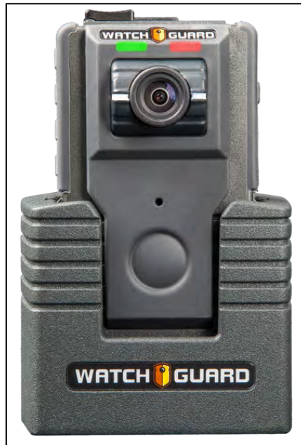
Figure 59. WatchGuard Vista Standard Capacity