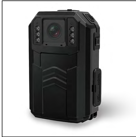
Figure 66. Zetronix HD Blue Line Police Body Camera