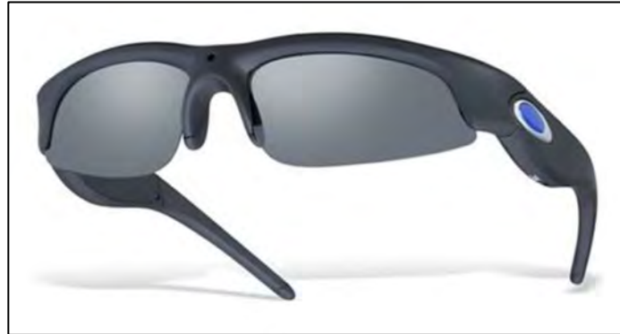
Figure 41. Primal USA DutyEGS Evidence Gathering Sunglasses