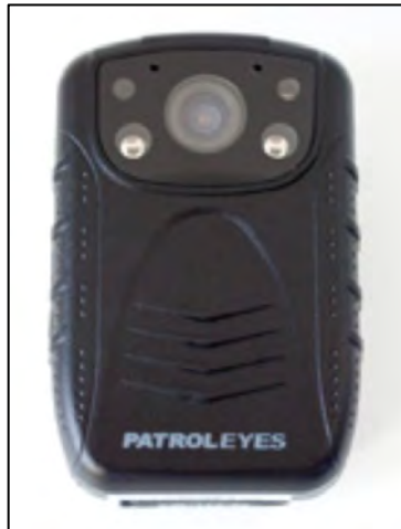
Figure 30. Patrol Eyes SC-DV1