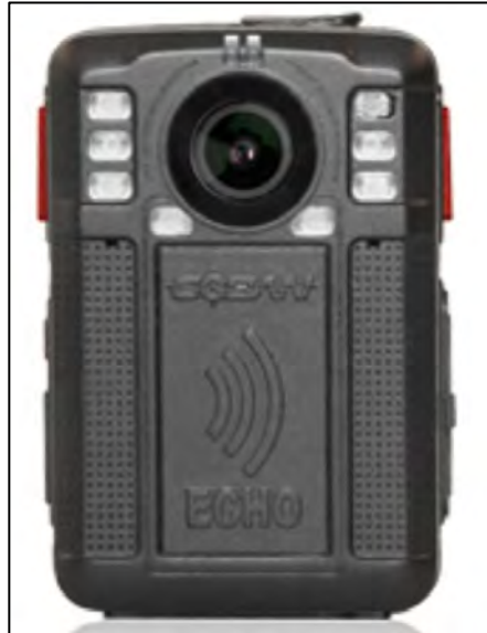
Figure 8. COBAN Body Camera