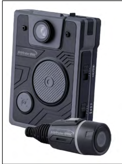
Figure 29. Panasonic Arbitrator