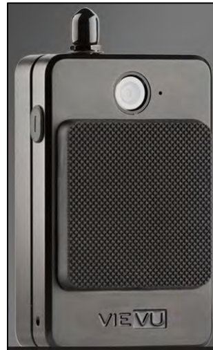
Figure 54. VieVu LE4