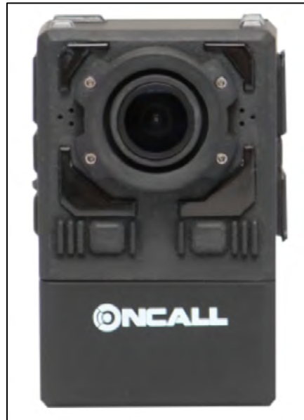
Figure 34. Paul Conway OnCall Camera