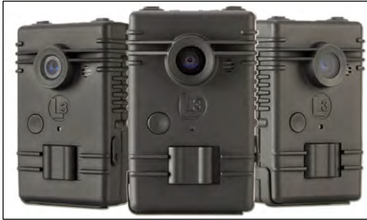
Figure 22. L-3 Mobile-Vision BodyVision XV