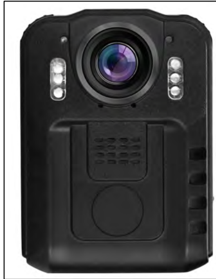
Figure 44. Primal USA DutyVUE PrimeOBSERVER 2020