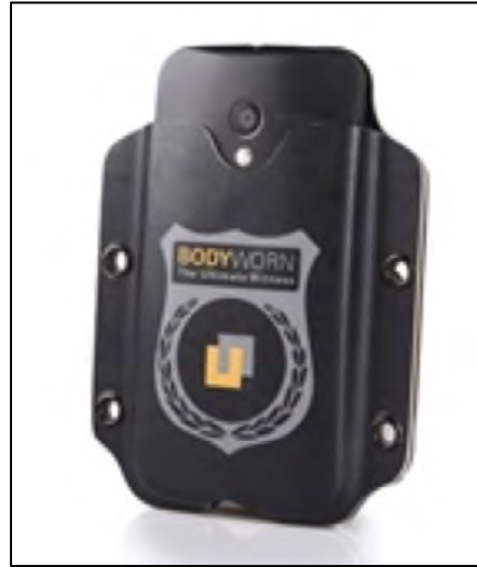
Figure 53. Utility BodyWorn