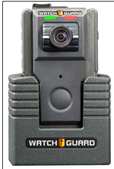
Figure 58. WatchGuard Vista Extended Capacity