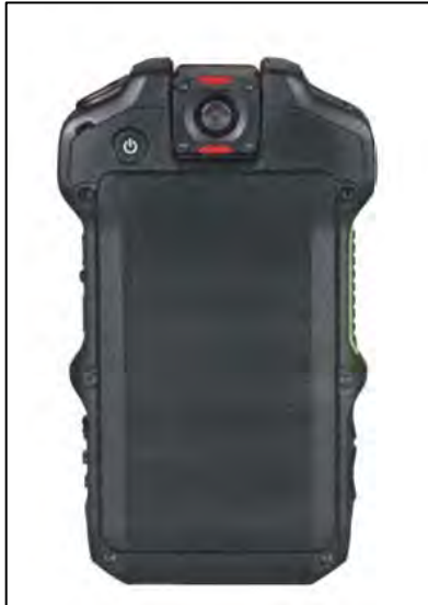
Figure 27. Motorola Si300 Video Speaker Microphone