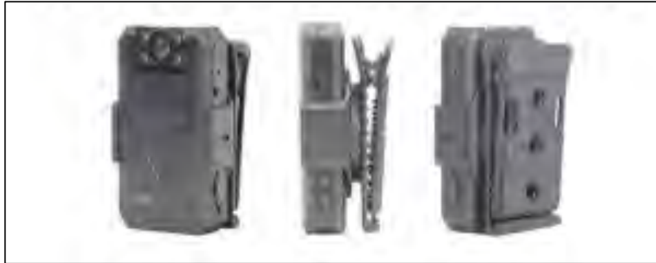
Figure 62. WOLFCOM Vision