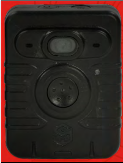
Figure 47. Safety Innovations VidCam VX