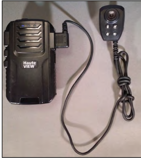
Figure 19. HauteSpot HauteVIEW 200