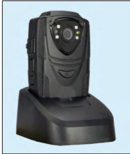
Figure 20. HD Protech CITE M1G2