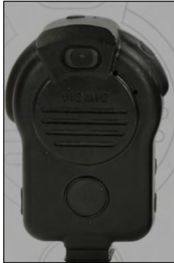
Figure 48. Safety Innovations VidMic VX