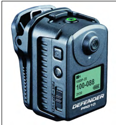
Figure 37. PRG 10 Defender Body Worn Camera