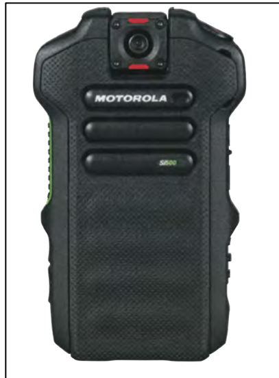
Figure 28. Motorola Si500 Video Speaker Microphone