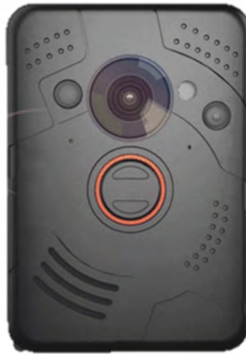
Figure 2. Black Mamba BMPpro Elite