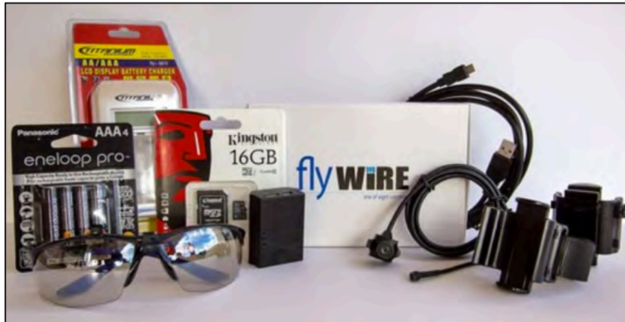
Figure 14. FlyWire Glasses Worn Security Cam Kit