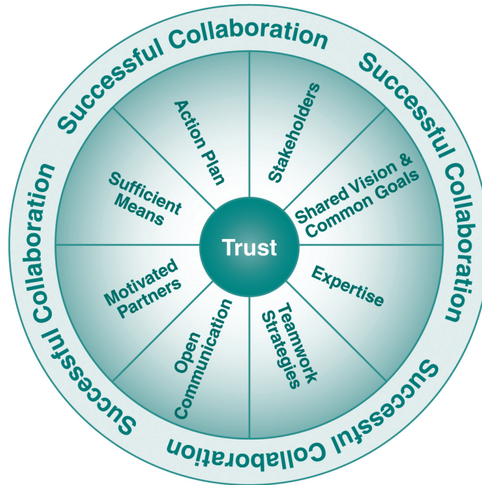
Figure 1. The Collaboration Process